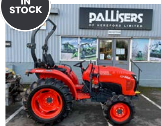
KUBOTA L1-382 HST 3 cylinder 37.HP diesel engine, HST transmission, foldable rops.