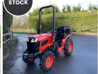
KUBOTA B1-241 24hp, 3 cylinder, 4wd, narrow width under 1m.