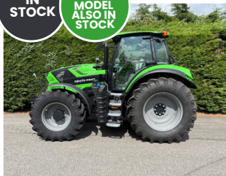
DEUTZ FAHR 6170 RC SHIFT 170hp, 6 cylinder, 50k, Front & cab suspension, powershift transmission, front linkage 2 rear spools, dromone PUH, 2 mid mount with front linkage and service, Manual AC, Air & hydraulic brakes, 650,s