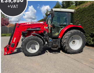
MASSEY FERGUSON 5712S 17 reg 3400 hours, c/w Massey Ferguson loader 946 4 cylinder, 120 hp (130 hp max), 40K, air con, power shuttle