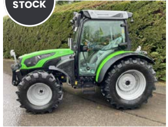
DEUTZ FAHR 5115 D TTV 115 hp (boost to 126 hp), full CVT transmission, independent front axle suspension, front linkage and PTO, electric spools, air con, electric rear lift