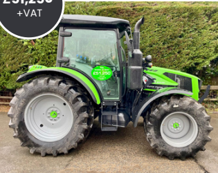
DEUTZ-FAHR 5125 KEYLINE Loader ready, HML 3 Speed powershift, air con, air seat, 3.8l engine.