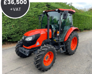
KUBOTA M4-063 63hp Diesel Engine, 6 Speed Fully Synchronised Transmission, Rear Hydraulic Lift, Optional Powershift, 5 Year/2,000 Hour Warranty, 2 Year 0% Finance Available