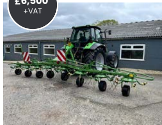
KRONE KW 7.92 TEDDER

2012, working width 7.9 m, 8 rotor, manual steering.