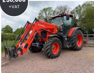
KUBOTA M6-132 & LOADER 2023, approx 1600 hours, c/w loader, 4 cylinder, 132hp ( boost to 142), 45 k, Aircon, power shuttle.