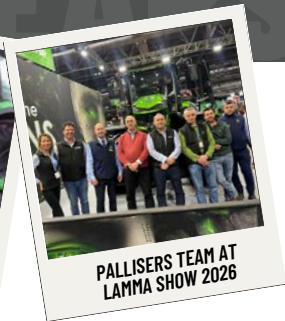
PALLISERS TEAM AT LAMMAS SHOW 2026

This year, we celebrate 20 years since we took on the Deutz-Fahr franchise in 2006. Since then, we have grown the brand in the Hereford area, selling over XX tractors since we began. We always have a range of NEW and USED Deutz-Fahr tractors in stock, and our team has many years of expertise to help customers find the right model for their farming outfit.