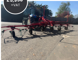
KVERNELAND 8076 TEDDER

2011, 6 Rotors, 7.6m meter working width, 7 tine arms per rotor