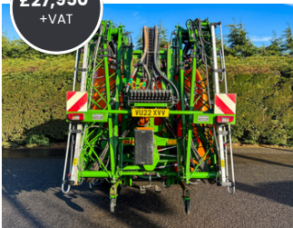
AMAZONE UF1801 SPRAYER

2017, ISO Bus, Distance Control+ auto boom height (4 sensors), 11 section (GPS section control capable), triple nozzle body, DUS boom recirculation, Boom lights.