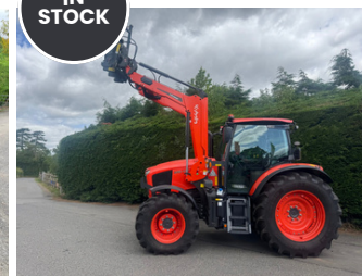
EX DEMO KUBOTA M6-132 133 hp / 153 hp with boost. 45 kph, Front axle suspension, Cab suspension, 3 mechanical spool valves, LK2100 M self levelling loader, 5 year warranty / 3000 hours as standard (upgradeable to up to 6000 hours)

KUBOTA GR1600ID KUBOTA GR1600ID KUBOTA Z1-421 KUBOTA Z2-481