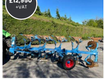
LEMKEN JUWEL 7 5 FURROW PLOUGH

4 + 1 furrow, 2018, shear bolt, rear discs, depth / transport wheel.