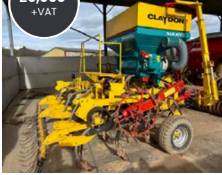
CLAYDON 3.5M MOUNTED DIRECT DRILL

2008, good genuine drill, land wheel driven, bout markers, road lights.