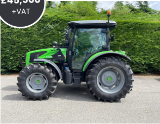
DEUTZ FAHR 5105 KEYLINE GS 105 hp, air con, high vis roof, 40F/40R - 2 speed power shift, full loader ready.