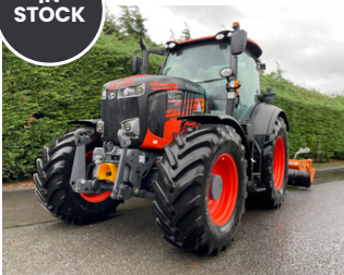
KUBOTA M7-174 KVT 170 hp, KVT - full CVT (vario) transmission, Electric handbrake, Air cab suspension, ISOBUS, Autosteer ready & fast steer, front PTO, apple car play Warranty options available.