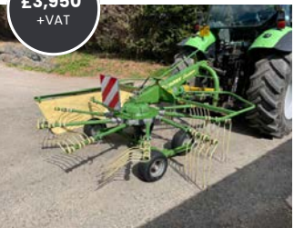
KRONE SWADRO 35 RAKE