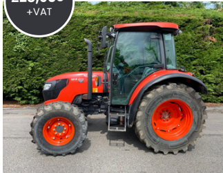
KUBOTA M4-073 2023, 1800 hours, aircon, air seat, rear fender extensions, auto hitch, power shuttle.